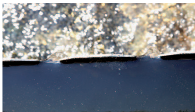
Activated sludge flocs sometimes are insufficiently retained by the secondary clarifier.