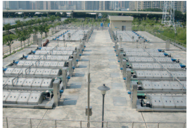
28 RoDisc® Rotary Mesh Screen units with 24 discs each treating about 8.5 m 3 wastewater per second