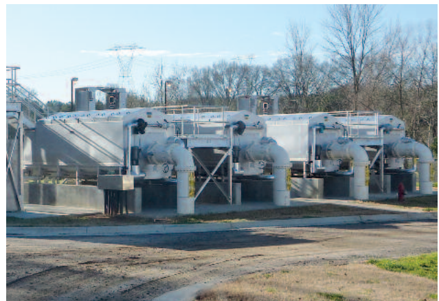
4 RoDisc® Rotary Mesh Screen units with 18 discs installed in a concrete tank