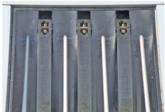
Backwashing of filter discs with filtrate – no external wash water required