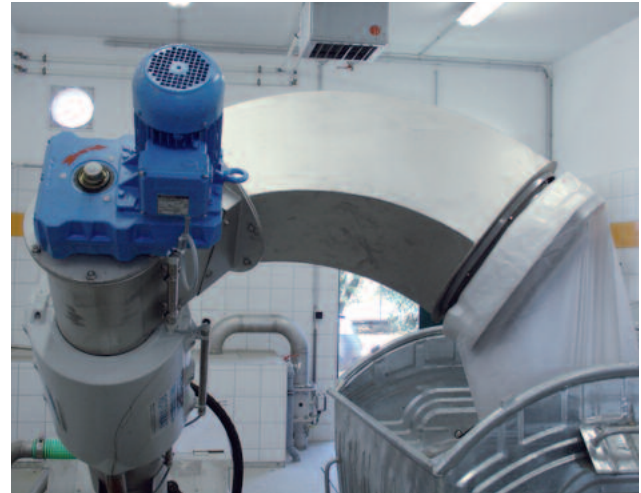
Individually adapted installation with lateral screenings discharge directly into a container