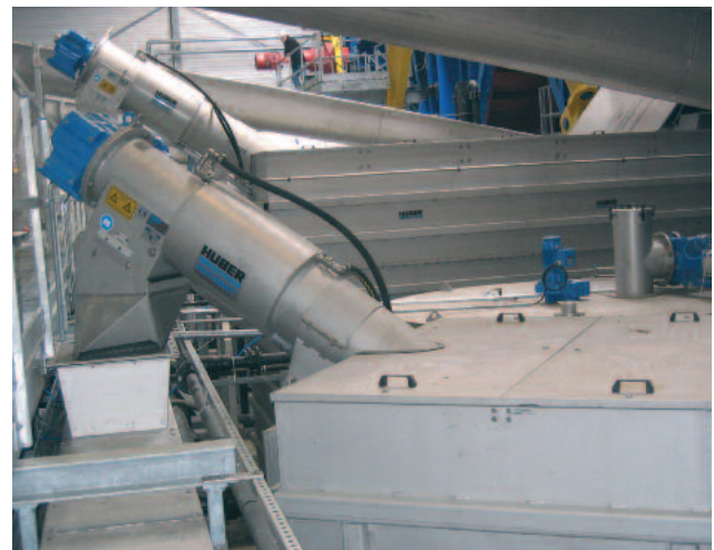
... from size 600 to size 2400