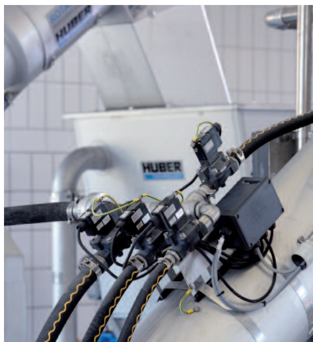
ROTAMAT® Rotary Drum Fine Screen with integrated screenings washing IRGA

The dewatering performance can be increased to more than 45 % DR by adding a high pressure unit (HP) to the integrated screenings washing system IRGA. This combination guarantees the maximum dewatering performance and reduces disposal and operating costs.