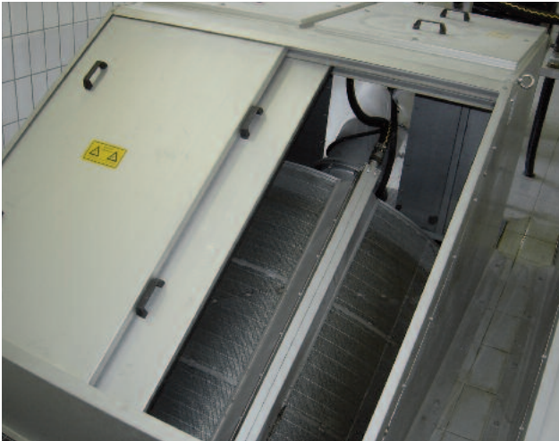
ROTAMAT® Rotary Drum Fine Screen Ro 2 installed in the channel with a movable stainless steel cover, size 600 to 3000