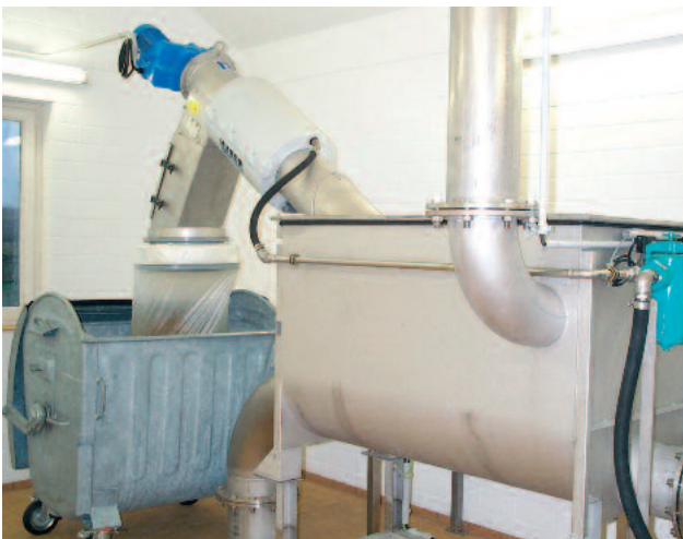
Tank-mounted ROTAMAT® Rotary Drum Fine Screen ...